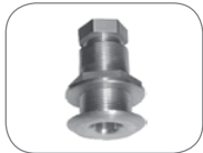
Stainless Stuffing Tube: 33-541-01