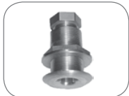
Stainless Stuffing Tube: 33-541-01